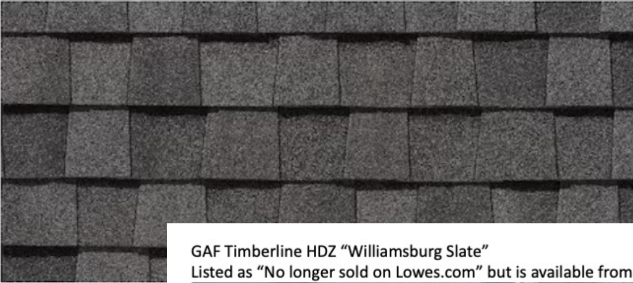
GAF Timberline HDZ "Williamsburg Slate" Listed as "No longer sold on Lowes.com" but is available from other websites