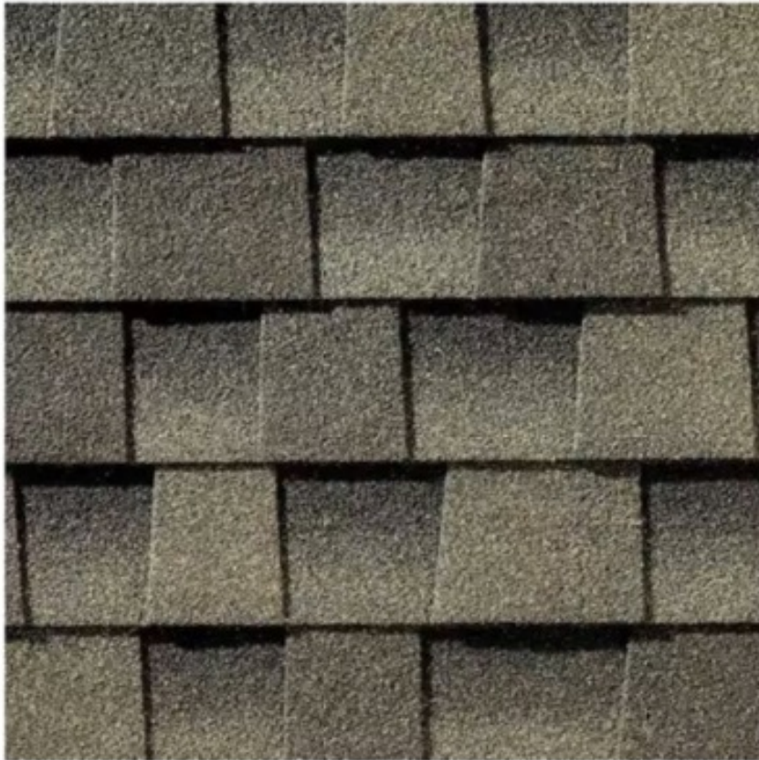
GAF Timberline HDZ "Weathered Wood" (Approved for 104C and 103A)